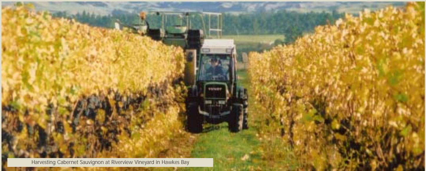
Harvesting Cabernet Sauvignon at Riverview Vineyard in Hawkes Bay

vines. The warmer than average vintage has contributed to the more fruity style of this wine. It also exhibits the effects of using a larger percentage of whole berries in the ferment, a technique that contributes more jam flavours to the wine.