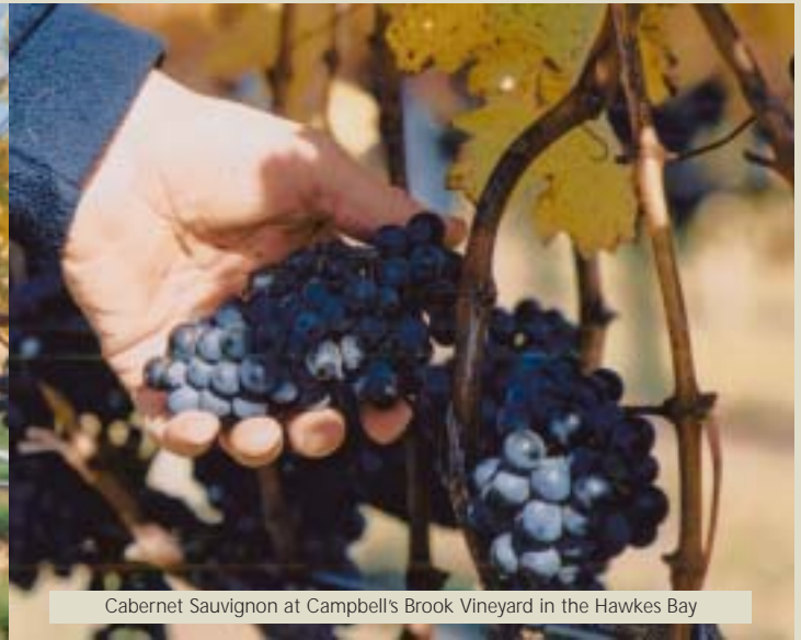
Cabernet Sauvignon at Campbell's Brook Vineyard in the Hawkes Bay