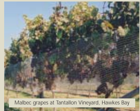
Malbec grapes at Tantallon Vineyard, Hawkes Bay