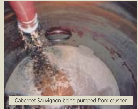
Cabernet Sauvignon being pumped from crusher

Look for some great red wines too, with conditions right for delivering solid, flavoursome reds. White wines such as the chardonnays and sauvignon blancs will be the reminiscent of the 2002 vintage, which was anything but bland.