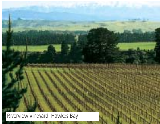
Riverview Vineyard, Hawkes Bay

The 2002 vintage has shaped up as a great vintage reminiscent of the Bordeaux vintage of 2000, according to our winemakers.