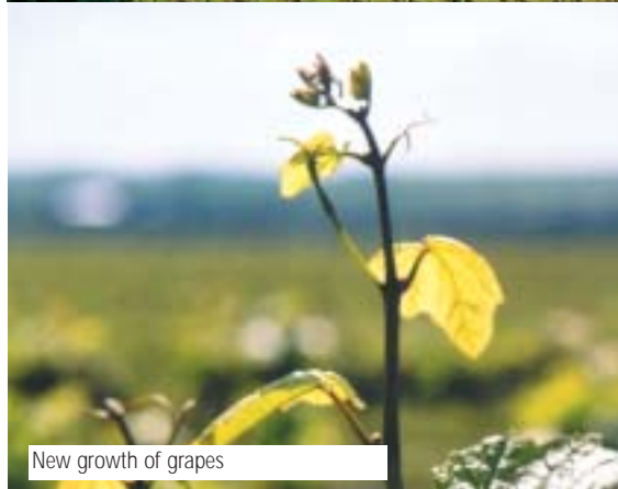
New growth of grapes