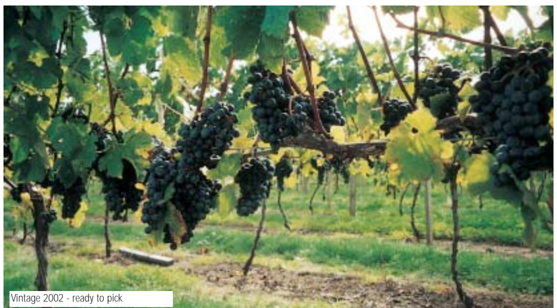
Vintage 2002 - ready to pick

The 2002 Sauvignon Blancs are on the market now, as well as the 2002 Mercure and 2002 Boar's Leap. Call our Cellar Door at Katikati for further information on 0800 667 866 or visit the website, www.mortonestatewines.co.nz for information on new releases.