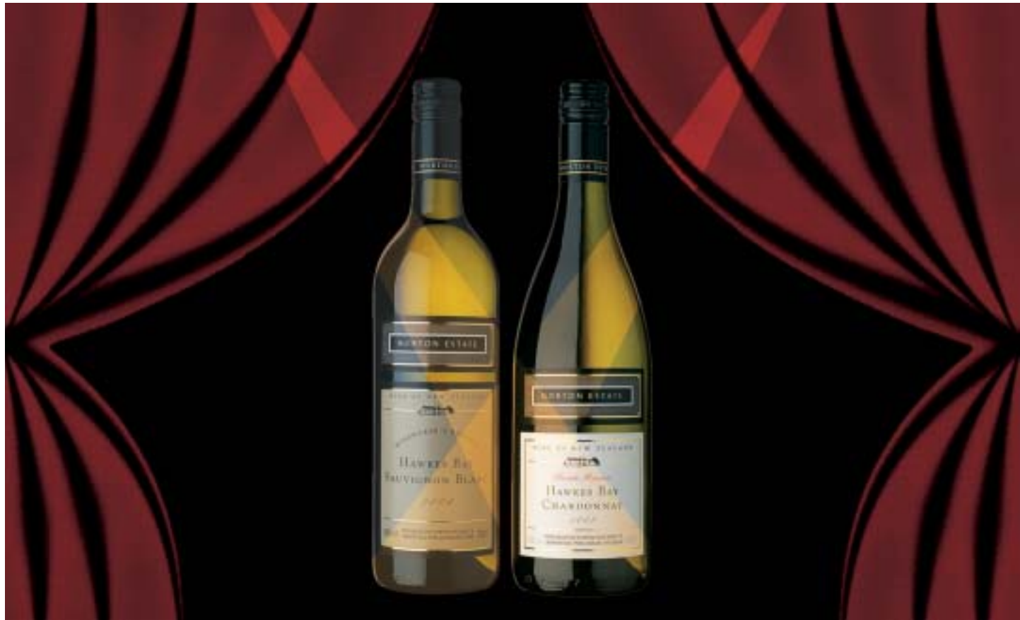
Two stunning new releases: Winemaker's Reserve Hawkes Bay Sauvignon Blanc 2004 and Private Reserve Hawkes Bay Chardonnay 2002.