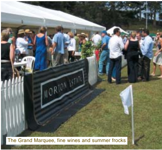
The Grand Marquee, fine wines and summer frocks