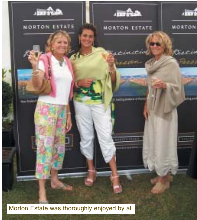
Morton Estate was thoroughly enjoyed by all