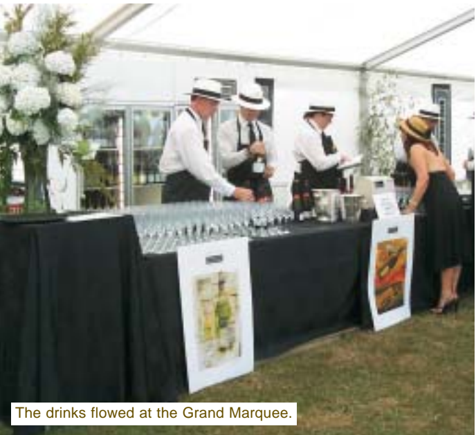
The drinks flowed at the Grand Marquee.