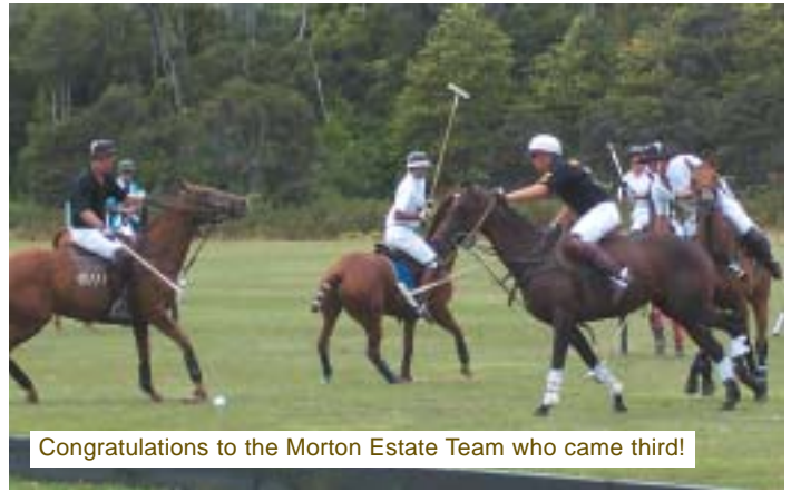
Congratulations to the Morton Estate Team who came third!

The sport of polo has a clean green image, and, like Morton Estate, has interests in terroir and how the environment affects all aspects of its operation. NZ Polo also wanted a 100 per cent New Zealand owned company as its partner for the tournament.