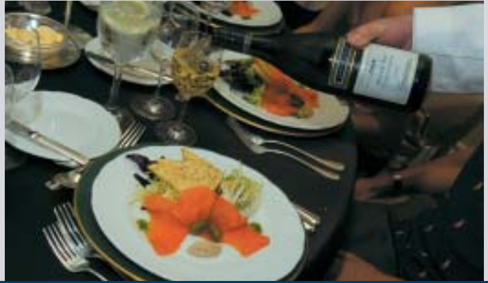
Exquisite food and fine wines