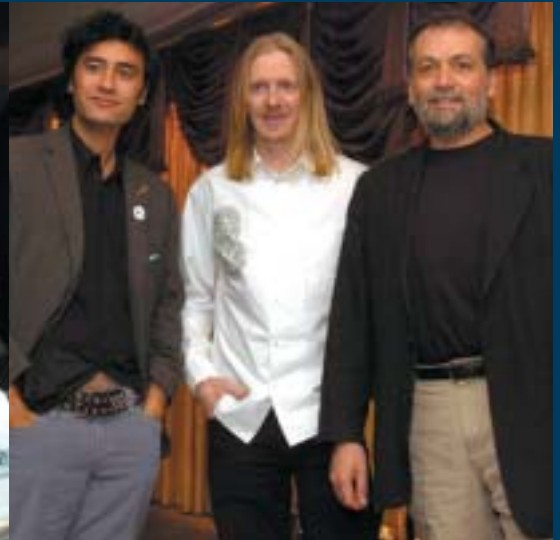
New Zealand Academy Award Nominees

Morton Estate Wines joined the movie stars and film industry glitterati in Los Angeles for a pre-Oscars party as New Zealand celebrated three Academy Award nominations. Guests enjoyed a stunning range of Morton Estate Wines – including Morton Non-Vintage Brut, White Label Marlborough Sauvignon Blanc, White Label Hawkes Bay Chardonnay and the White Label Hawkes Bay The Mercure.